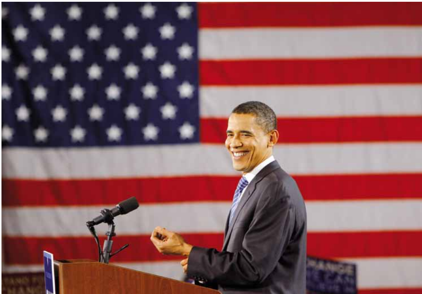
Barack Obama